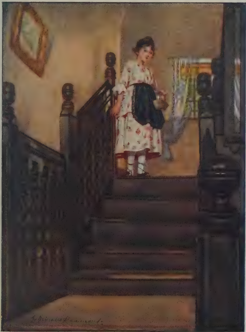
I SAW HER TURN ROUND, IN THE GRAVE LIGHT OF THE OLD STAIRCASE, AND WAIT FOR US